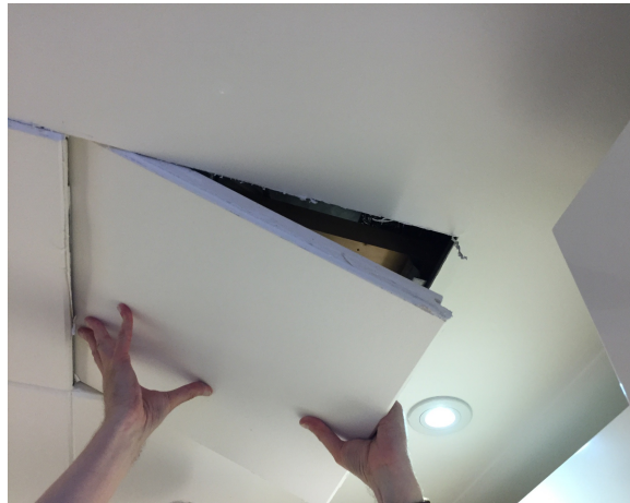
Photo 4: the side with the slot will release and the tile can be lifted down.