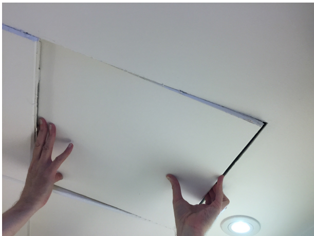
Photo 3: push up on the side with the lip, supporting the tile so it does not drop. It is heavy and fragile.