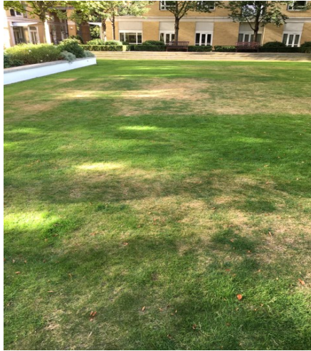
Before (August 2016)